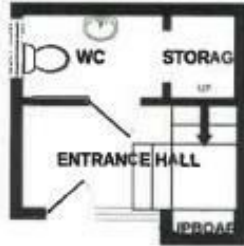
GROUND FLOOR 226 sq.ft. (20.9 sq.m.) approx.